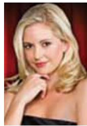
AMITY DRY Singer/Songwriter