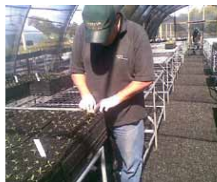
• Propagation starts for the Lower Lakes at Orana Melaleuca