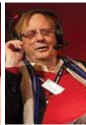
PETER GOERS Media Personality