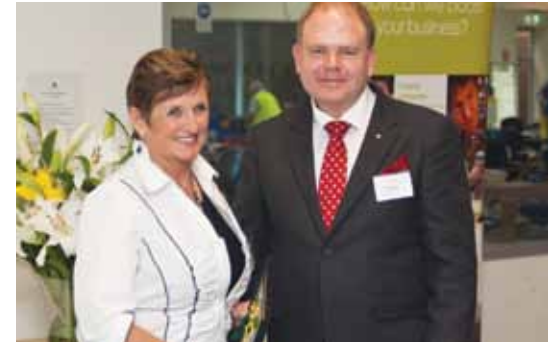
ABOVE FROM TOP: