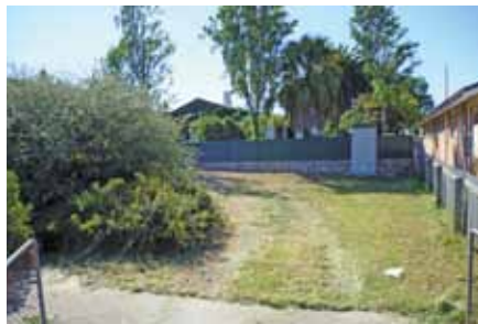
• Before and after shots showing the great work of Orana Green team. Left top and bottom: Aberfoyle Park, Happy Valley and right top and bottom, Port Vincent Main Street, Yorke Peninsula