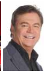
DARYL SOMERS Media Personality